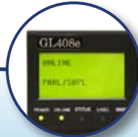
Large LCD Display Panel